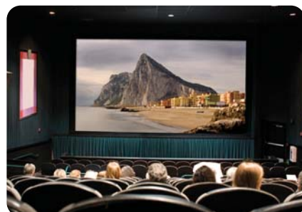
> Movie 电影