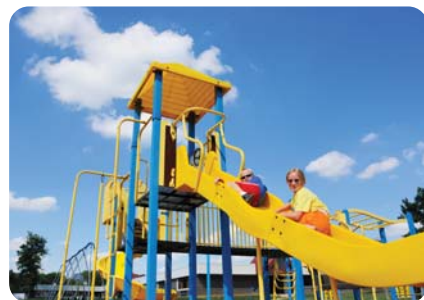
> Playing with Kids 和小孩玩乐