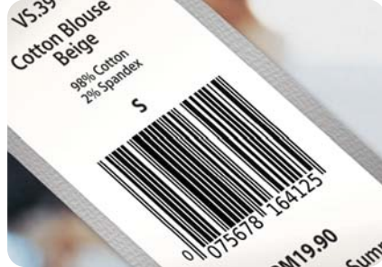
> Price Tag 价格标签