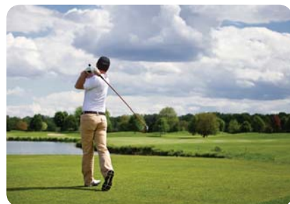
> Sports 运动