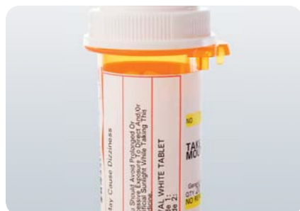
> Labels 标签