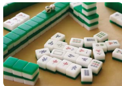
> Mahjong 麻将