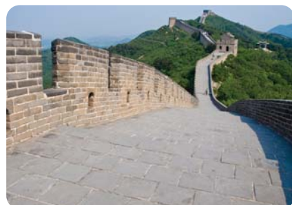
> Travel 旅游