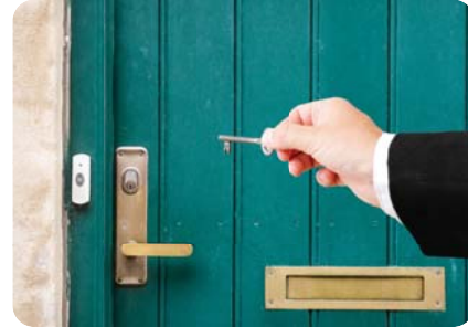
> Unlocking the Door 开门锁