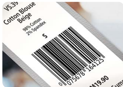
> Price Tag 价格标签