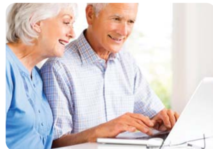
> Computer 电脑