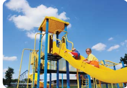
> Playing with Kids 和小孩玩乐