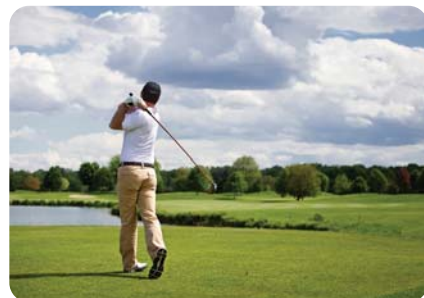
> Sports 运动