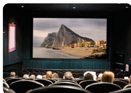
> Movie 电影